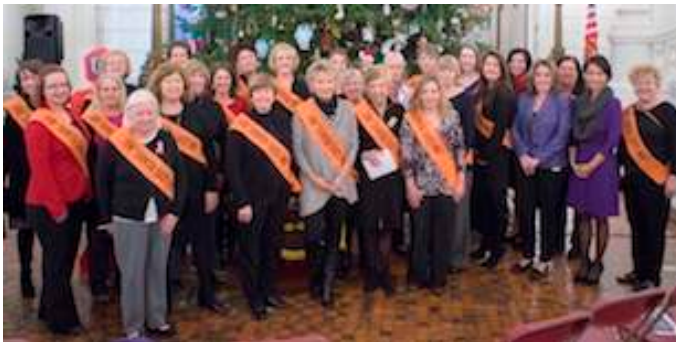
Members attend the Zonta Says "NO" To Violence Against Women rally at the Harrisburg State Capitol

Club membership in this classified service organization is by invitation. Members become part of a global network of professionals, who are committed to equal rights and a life free of violence for all women and girls.