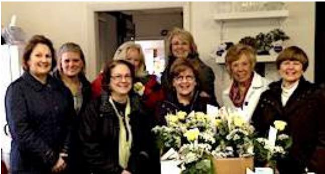
Members present the Zonta Rose to residents at Shalom House